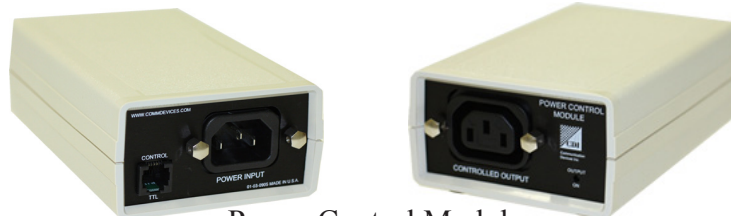
Power Control Modules

The PA111-AES has one serial interface for connection to a remote console port and also supports an optional Secure Power Control Module for remote power reboot capability.